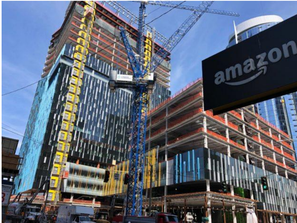
Amazon continues work on new buildings at its headquarters in Seattle.