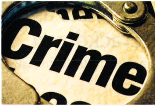
Kent Police up patrols near Springwood Park after residents' complaints JUL 5, 2019

The fourth suspect is a 16-year-old Tukwila boy arrested for investigation of vehicular homicide after a head-on crash June 30 along Canyon Drive that killed a 13-year-old girl who was a passenger in his car.