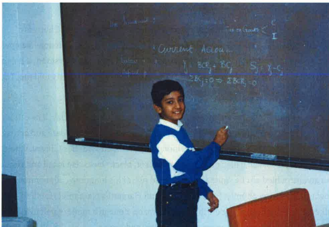
Chetty at age 9. He was later valedictorian of his high school, and he went on to earn an undergraduate degree and a doctorate in economics from Harvard University. At age 28, he was among the youngest faculty members in the university's history to be offered tenure.

In 2013, Chetty released a colorful map of the United States, showing the surprising degree to which people's financial prospects depend on where they happen to grow up. In Salt Lake City, a person born to a family in the bottom fifth of household income had a 10.8 percent chance of reaching the top fifth. In Milwaukee, the odds were less than half that.