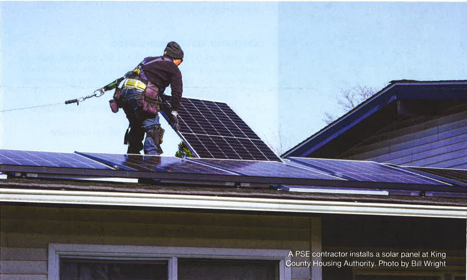
A PSE contractor installs a solar panel at King County Housing Authority.

The latest news on what's powering our neighborhoods