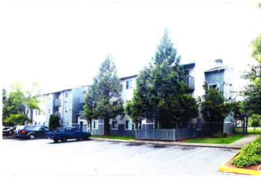
The Meadows on Lea Hill apartment complex was the scene of a shooting Friday night.

Auburn Police are investigating a shooting between two men at the Meadows on Lea Hill apartment homes Friday night.